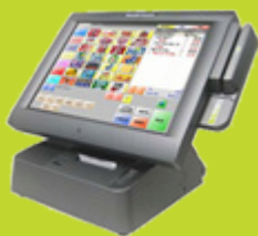
ProsPay Touch All-In One®