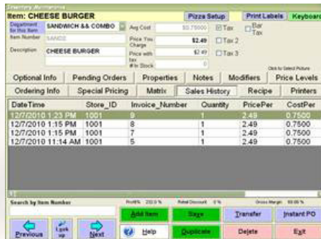
Inventory Maintenance Screen