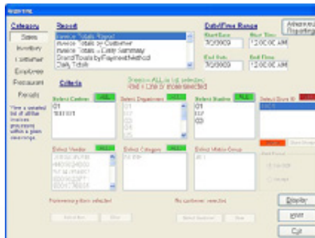
Reporting Tools Screen